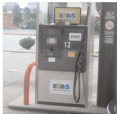
This E85 pump located at the Citgo station at 500 N. Main Street was the first in Nashville available for public use.

The organization received designation as part of the national Clean Cities program from the United States Department of Energy in October 2004. Designation is an important event recognizing a coalition's work to further develop the alternative fuel market and other Clean Cities petroleum reduction technologies.